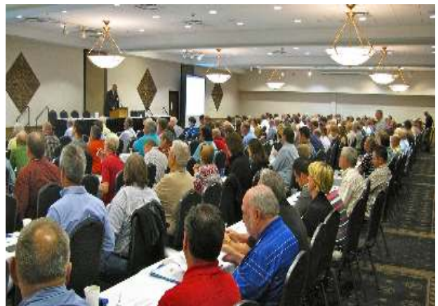
A packed room at the 2013 Day with Appraisers Seminar

If you have questions or need more information, please call the AALCB office at 501-296-1843.