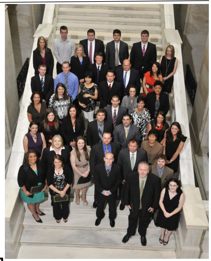
2012 Swearing-In Ceremony Honorees